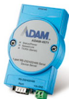
ADAM-4571 1-port RS-232/422/485 Serial Device Server