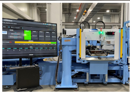
Advantech and Tien Kang Develop Smart Digitized Shoe Manufacturing Solution P.16